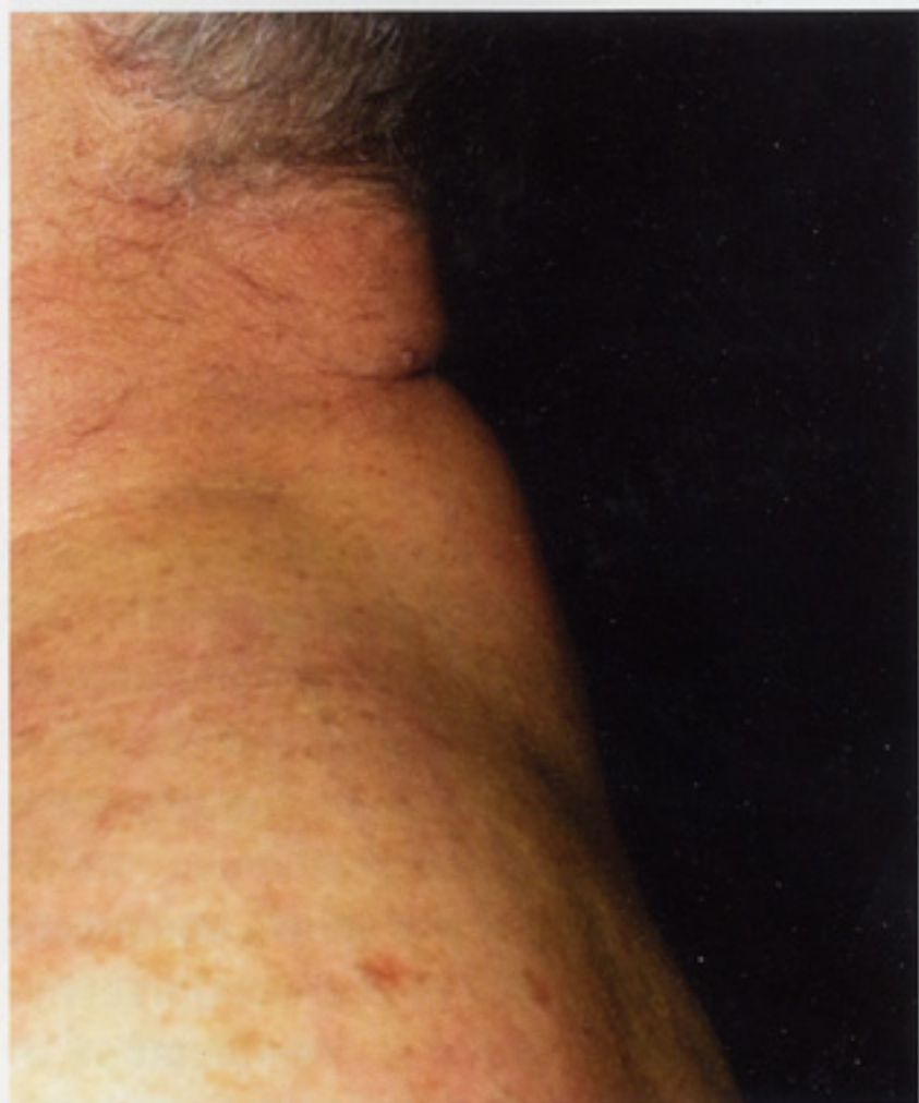
FIGURES 1 AND 2. Before and after 3 treatment (lateral vision)

Two weeks after last sit a new ultrasonographic examination was performed to assess the result; it showed 2.4 mm reduction of the dorsocervical fat pad.